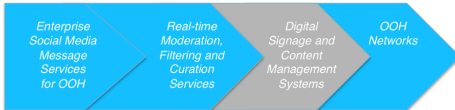
FIG.4. The Social OOH Value Chain.

A simplified value chain for social OOH is represented in FIG 4.